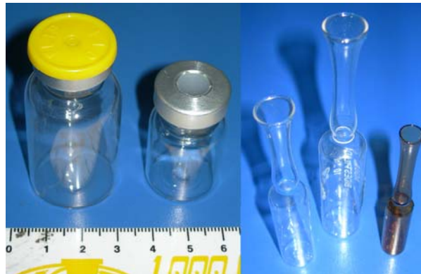
Apply labels to ampoules or other unstable round products

Ketan Automated Equipment, Inc. offers a wide range of coding, labeling & product handling systems for identification of products in multiple types of industries. As part of the continuing process of development Ketan reserves the right to alter the specifications and other details of its products without notice. Please ask Ketan for the latest details