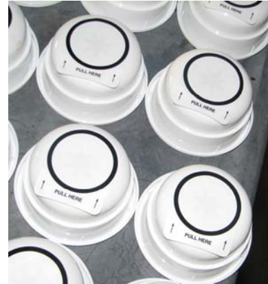
Excellent Label Placement Accuracy

Ketan Automated Equipment, Inc. offers a wide range of coding, labeling & product handling systems for identification of products in multiple types of industries