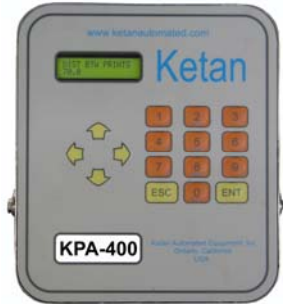
Programmable Controller with LCD display