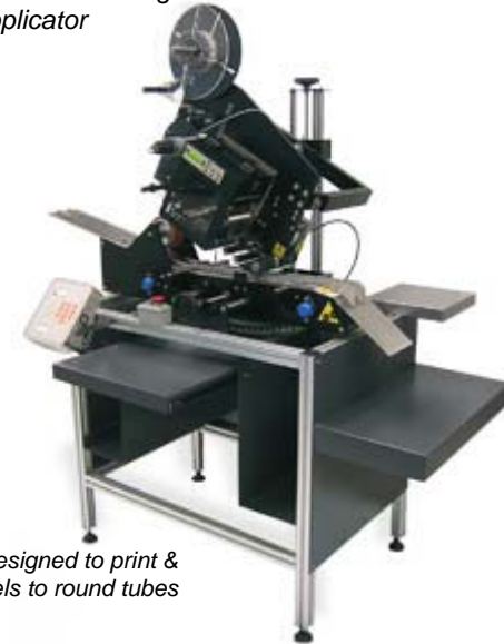
System designed to print & apply labels to round tubes