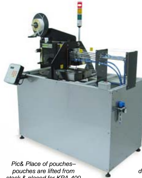
Pic & Place of pouches— pouches are lifted from stack & placed for KPA-400 to print & apply label