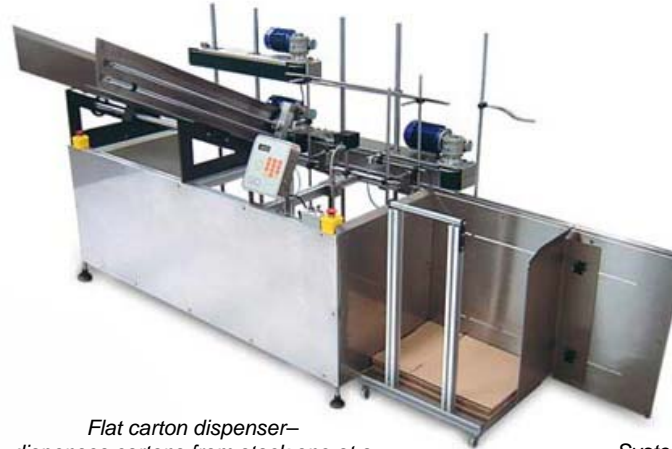
Flat carton dispenser— dispenses cartons from stack one at a time to be labeled prior to erecting carton

Examples of some of the various Ketan product handling systems for the KPA 400 printer applicator