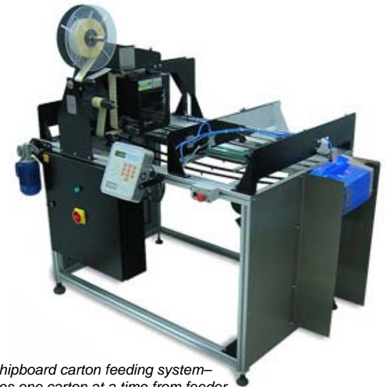
Flat chipboard carton feeding system— dispenses one carton at a time from feeder magazine & conveys cartons under KPA 400 for label placement